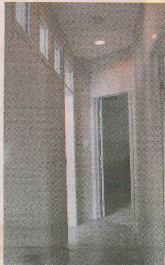
The west wing: Two bedrooms and a bathroom can be accessed by a separate entrance to the home. Mike Harasym's design is focused around twenty-first century, sandwich-generation families. "If the parents need to live with the owners or adult children move back home or there are older teens, this is the perfect arrangement to give everyone privacy," he says. Transom windows over all doors and in the hallway separating the two living spaces ensures that the home's whole atmosphere is open and airy.

The ensuite is as intriguingly up-to-date as the rest of the house with a shower stall extraordinary. A curved glass block wall separates the large stall. This and a slanted ceramic tile floor keep the rest of the bathroom from being drenched - no shower door or curtain needed.