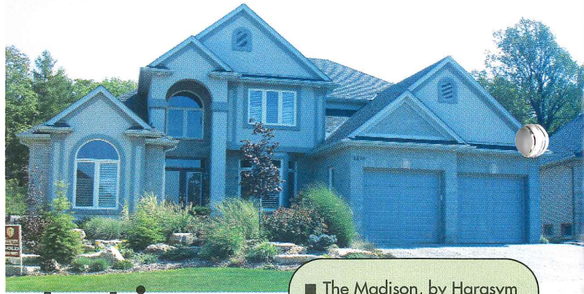
■ The Madison, by Harasym Developments Inc., combines brick and detailed stucco to capture its two-storey elevation and stately architecture.