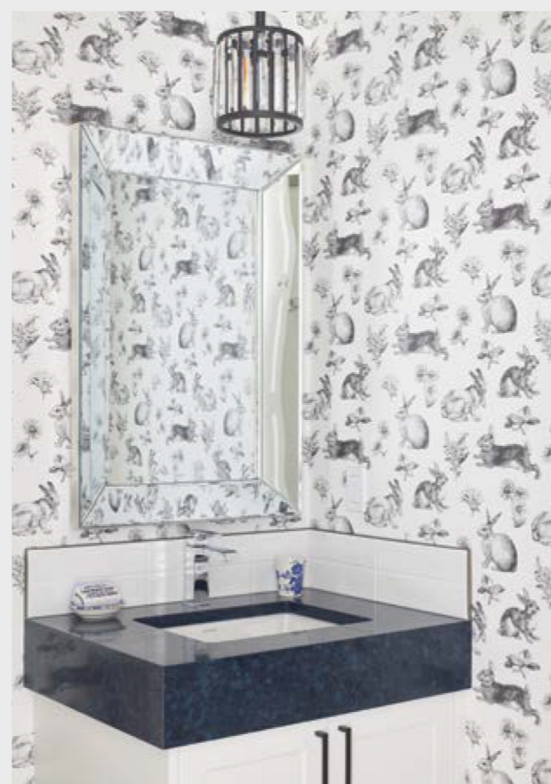
LEFT: Glass-panned double doors (North Pole) open to a small office that is bright and fresh thanks to white wall panelling (North Pole) and contrasting walls in Newburyport Blue (Benjamin Moore). ABOVE: A fanciful choice for wallpaper in the powder room. BELOW: Soft blues and taupe in the living room include walls in Beacon Gray (Benjamin Moore).